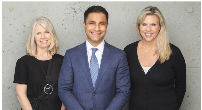
Gill Wealth Management Group TD Wealth Private Investment Advice